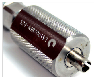
Parts Marking & Serialization