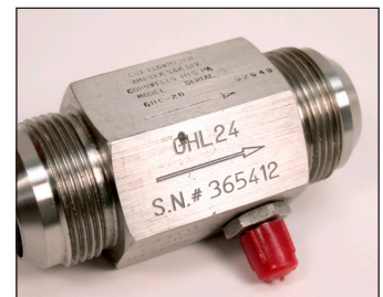
Parts Marking & Serialization