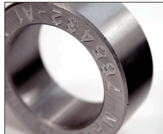
Parts Marking & Serialization