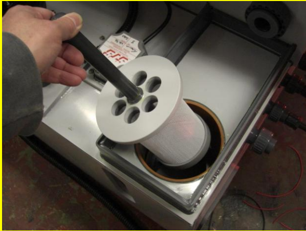
External access filter baskets